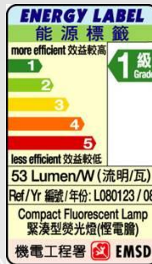
Compact fluorescent lamps