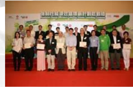
Launching ceremony with trade members