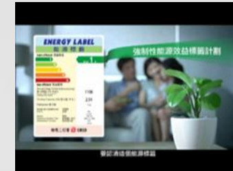
Announcement on TV