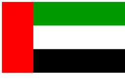
United Arab Emirates