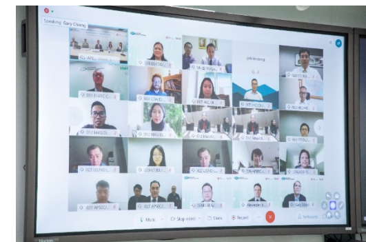
Online workshop on 17 November 2020